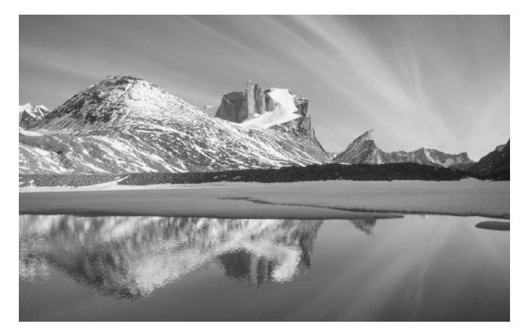
Microbes can thrive in almost any environment, from subzero Arctic ice to boiling underwater volcanoes.

Professor Adrian Gibbs of the Australian National University asserts, "You can increase the probability of finding new things by looking in interesting places, like deep sea vents or thermal pools, but you can also find them in your own backyard." <sup>2</sup> One teaspoon of ordinary soil contains 10 million bacteria, and one acre of soil can hold up to five hundred pounds of microscopic life. There is more unseen life than seen. The mass of all microbes on the planet is twenty-five times more than the mass of all other animals combined. The human race may believe it is at the top of the food chain, but microbes are the food chain.