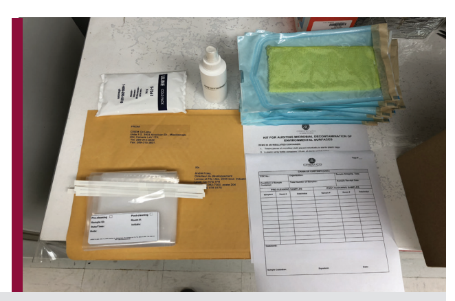
Figure 1. Contents of the audit kit. Product Code: #MAK-1

CREM Co's use of PCS patented process applied for auditing kit can sample environmental surfaces as large as 30x60 cm (1x2 feet) in healthcare facilities with >80% recovery of the microbial burden. The method is simple, economical and quantitative. The spray-and-wipe procedure using a microfiber cloth permits wiping of smooth and uneven surfaces while also recovering microbes in even dried surface biofilms. The kit can assess the presence of bacteria and fungi/unit surface area sampled. The turnover time of the method remains similar to that of other available methods.