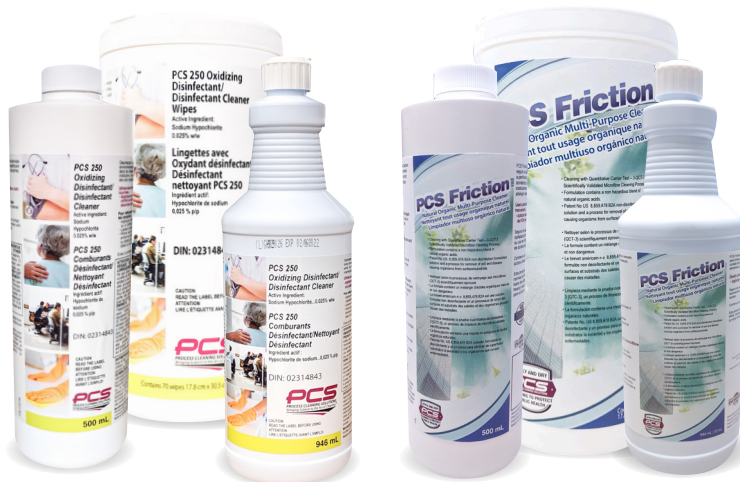
Neutral PH PCS 250 Oxidizing Disinfectant /Disinfectant Cleaner DIN 02314843